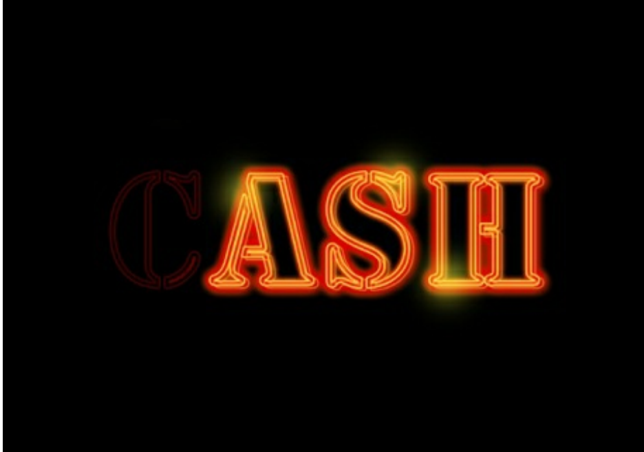
T-shirt graphic for Tamburlaine's latest collection